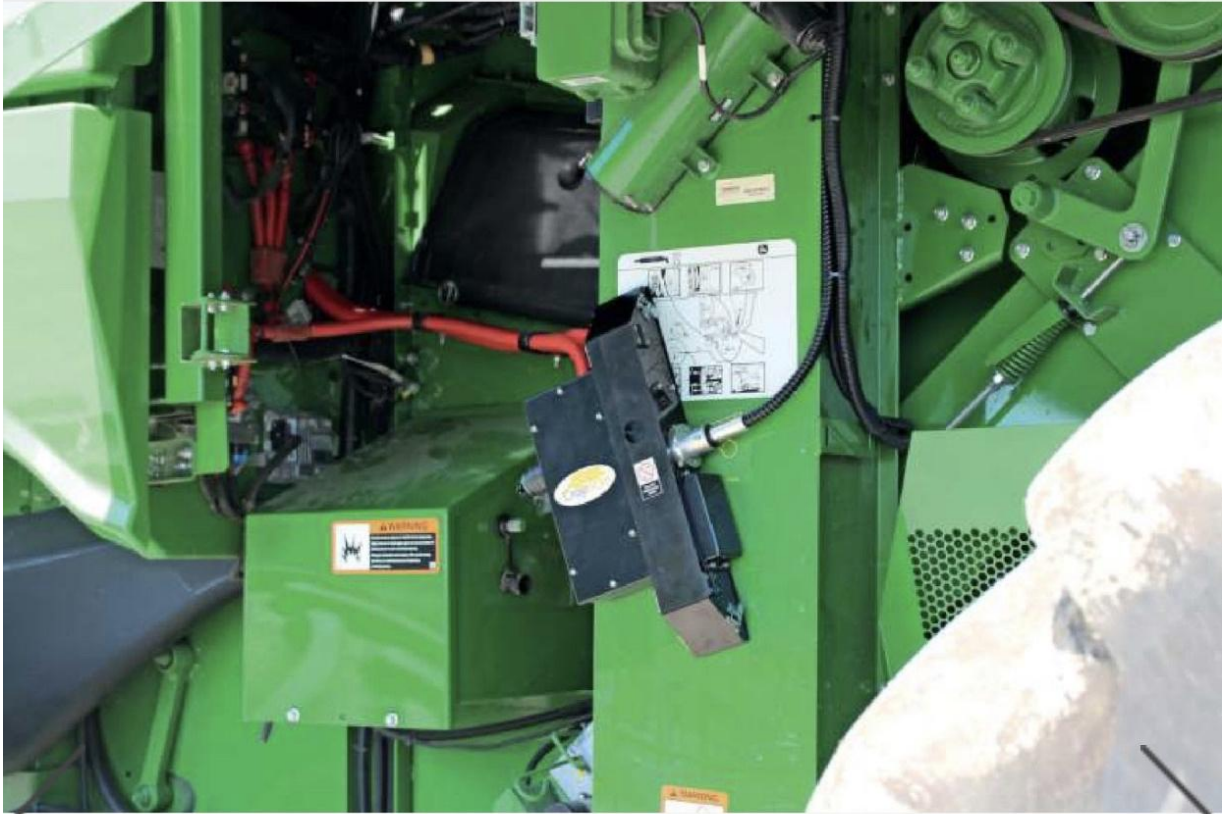
Via the sampling head of the CropScan (the black device) the grain is carried to the NIR spectrometer located in the cabin. The NIR spectrometer measures the amount of light absorbed by the protein, moisture and oil in the grains.

of vanes. Near infrared (NIR) light passes through the grain and is carried back to the NIR spectrometer located in the cabin via a fibre optic cable. It measures the amount of light absorbed by the protein, moisture and oil in the grains or oil seeds. The more light that is absorbed by each component, the higher the concentration. Samples are measured every 7-12 seconds or around every 15m down the row as the combine strips the grain. The protein, moisture and oil data are displayed on the Touch Screen PC mounted inside the cabin. The CropScan 3300H has been designed for use by farmers to segregate and blend grain in the field. The tabulated data provides the combine operator with a continuous stream of protein, moisture and oil results for each sample analysed. The paddock average, bin average and running average of five readings are displayed for all components. By clicking the field map button, the screen displays a real-time field map for protein, moisture or oil. Another click takes the operator to the trend plots screen. These plots show the progressive results plotted as a time graph. The operator can